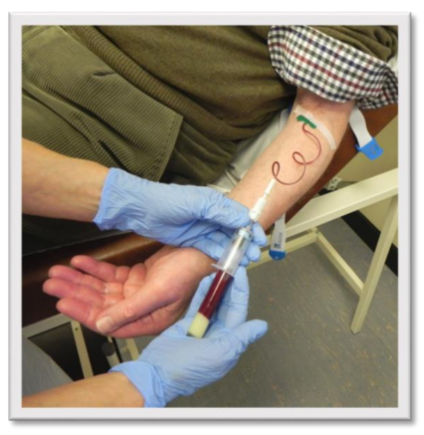
LBC1936 participants' blood samples used in a largest and genetically most diverse study of fibrinogen

LBC1936 blood samples contribute to the largest and most diverse genetic study of plasma fibrinogen